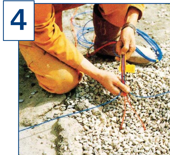
4. Fill stemming to top of hole.