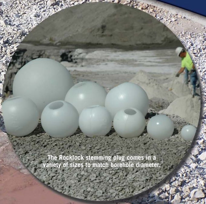
The Rocklock stemming plug comes in a variety of sizes to match borehole diameter.

With unmatched performance, Rocklock delivers a substantial return on investment and offers significant bottom-line savings for the site.