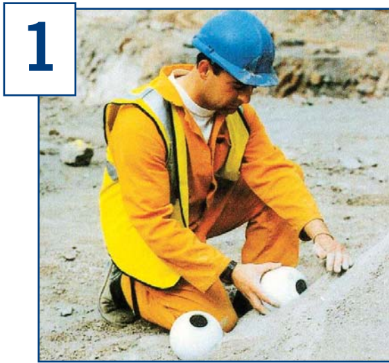
1. Select a Rocklock that is 90% of the borehole diameter. Then partially fill the Rocklock \frac{1}{2} - \frac{1}{3} full with stemming.

Rocklock Stemming Plugs Help Increase Blasting Safety & Improve Fragmentation